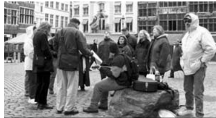
Celebrating Jesus in Antwerp Belgium