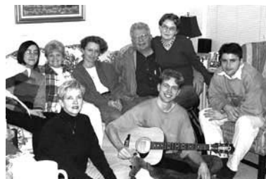
Another new Cell group - 6 nations are represented here

Equipping Update: The CLST Bible classes are growing! In the April class "The Book of Joshua", 18 students attended. We are encouraged by the consistent growth in numbers of students AND the growth in these young adults because of this equipping tool. The students represent 7 different nations.