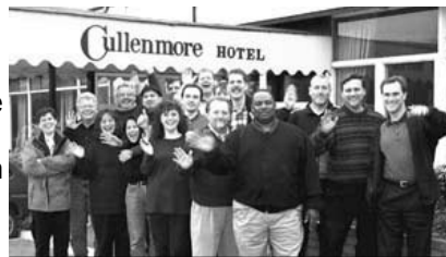
Pastors gathering in Ireland