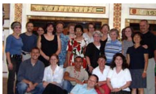
Spain Outreach Team

while we were there with the Horizon team. Much work was done and we had a lot of fun working together. We hope the pictures will share the idea of the time and work that was done with this very special team.