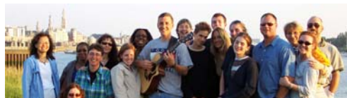
Antwerp Outreach Team

Antwerp, Belgium Intercession Outreach – it was great!! The 18 team members came from people from the Horizon Family of Churches in Germany, France, Holland, Russia and Washington State. We stayed at a youth hostel in the Orthodox Jewish section of the city - that was special. The purpose