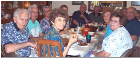
Dad & Mom's home group - great people